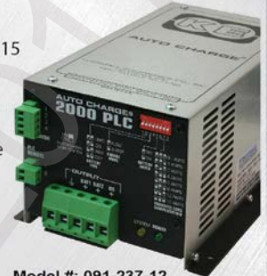
Model #: 091-237-12