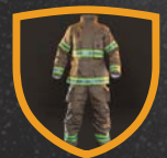
FXR Turnout Gear