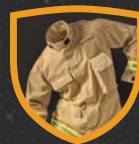
TEC GEN PPE

CHOOSE YOUR PPE FOR LONG TERM HEALTH INTRODUCING THE INTERCEPTOR PACKAGE™